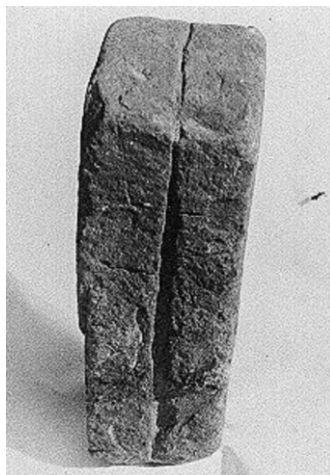
Fig. 3 Donald Viles (above) digs the Monument Rock from under a 100 year old spruce root in 1971. The top of the Monument Rock can be seen in the lower right photo above. It contains an incised line along 3 sides measuring 36 inches; an English unit of measurement.