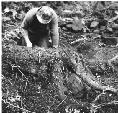
Monument Rock found a top the North Cairn. (See Fig. 2)

Ultimately it is up to the reader to make the connections between the legitimate first-hand evidence of the Wright