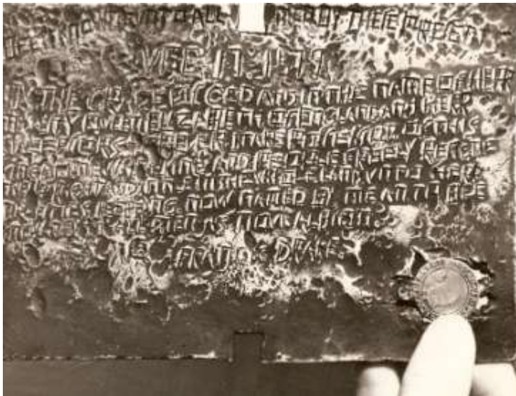
AP photo dated 4-14-1937 of the [fake] brass plate authenticated to have been left by Francis Drake in California.

California continues to claim that Francis Drake was the first European to land somewhere along the Northern California coast. It is a fact that in the summer of 1579 Francis Drake, with a crew of about 85 men and boys, spent some five weeks on the Pacific coast repairing his ship. He was on his way to become